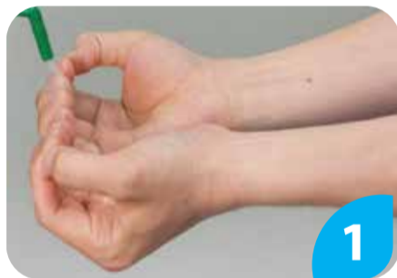
1 Apply a spray alcohol-based hand rub exposing nails and thumb, covering all surfaces

Duration of the entire procedure : 20-30 seconds