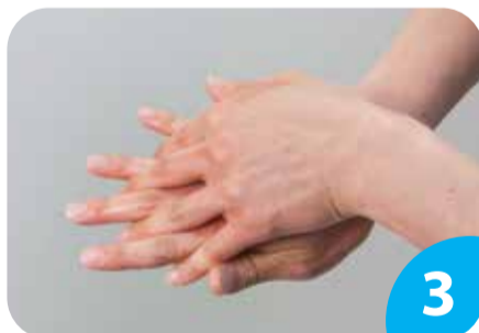
3 Right palm over left dorsum with interlaced fingers and vice versa