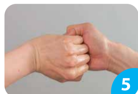
5 Backs of fingers to opposing palms with fingers interlocked