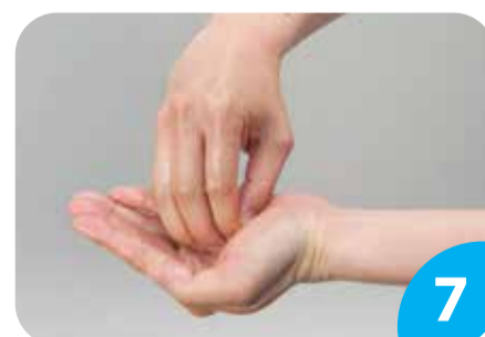
7 Rotational rubbing, backwards and forwards with clasped fingers of right hand in left palm and vice versa