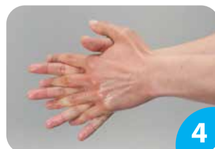
4 Palm to palm with fingers interlaced