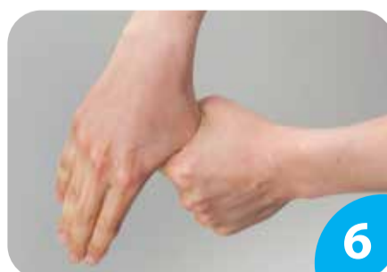
6 Rotational rubbing of left thumb clasped in right palm and vice versa