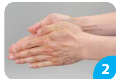
2 Rub hands palm to palm